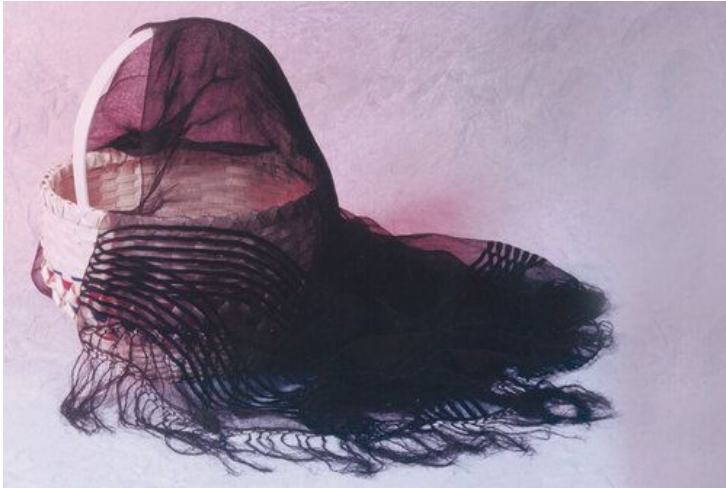
Polly Cooper's black shawl

As a token of gratitude, the wives of the camp gave her a black shawl. The shawl has been treasured as a symbol of the friendship between the United States and the Oneida Nation by generations of her descendants.