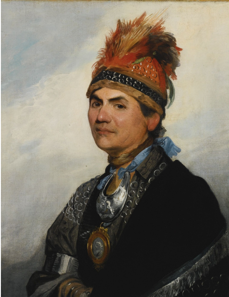
Joseph Brant Gilbert Stuart, 1786

Thayendanegea was born in 1743, a member and future chief of the Mohawk Nation. As a child, he was brought to a Christian school in Connecticut, where he became a translator for the British. At 15, he became involved in the French and Indian War, fighting with the British in multiple battles