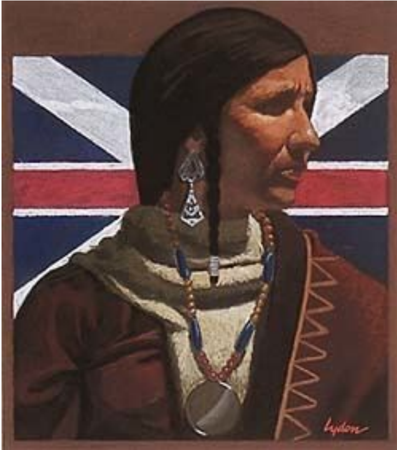
Molly Brant

Also known as Konwatsi'tsiaienni or Molly Brant, she was born around 1736. She was the daughter of two members of the Wolf Clan of the Mohawk tribe. It is believed she was also educated by the British