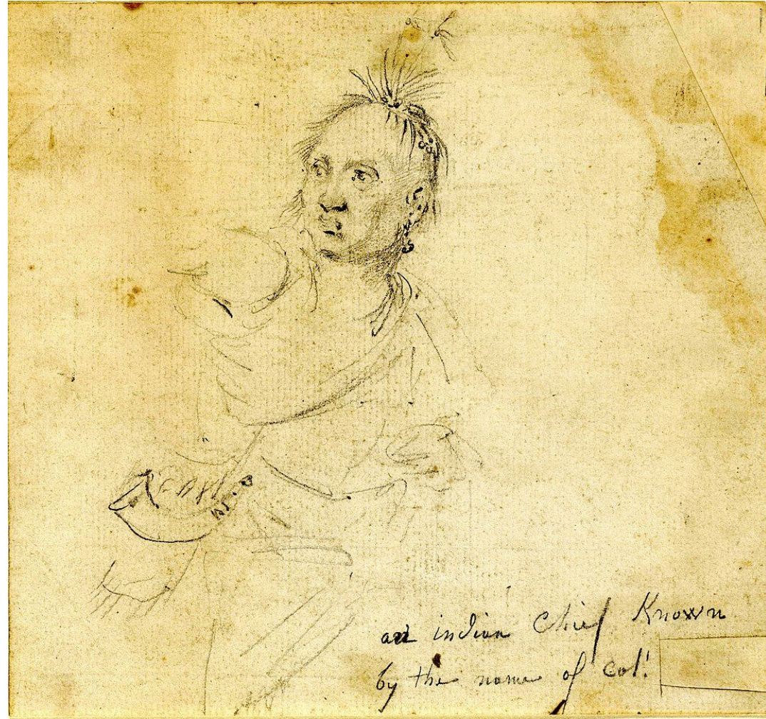
Colonel Louis of the Oneida, John Trumbull, 1785

The son of an Abenaki Native American woman and an African man, Akiatonharónkwen was captured in 1745 by a French-Mohawk raid and adopted by a Mohawk family. While he was raised in the Mohawk culture, Akiatonharónkwen was also educated at a Jesuit school and spoke French and English. He is also known as Joseph Louis Cook.